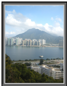
Chinese University of Hong Kong (CUHK): Hong Kong, China View from a dorm room

The list on this page contains links to view course catalogs and/or titles of courses offered at BU bilateral partner universities abroad. Most links provide access to a course description. You should review this list with your advisor to see which institution will provide you with the courses you need. If necessary, you will also want to discuss substitutions or waivers with the Department Chair.