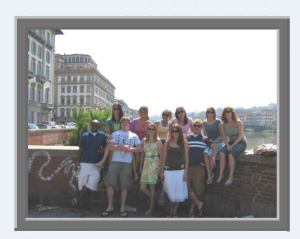
BU Business students in Florence, Italy on the Bellarmine Europe Program

KIIS offers summer programs in non-English speaking countries. Most are conducted in English. The academic focus will vary by country.