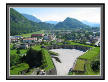
University of Kufstein Tirol: Kufstein, Austria

Chinese University of Hong Kong (CUHK): Hong Kong, China View from a dorm room