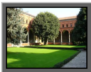
Università Cattolica del Sacro Cuore: Milan, Italy

The list on this page contains links to view course catalogs and/or titles of courses offered at BU bilateral partner universities abroad. Some links provide access to a course description. You should review this list with your advisor to see which institution will provide you with the courses you need. If necessary, you will also want to discuss substitutions or waivers with the Department Chair.