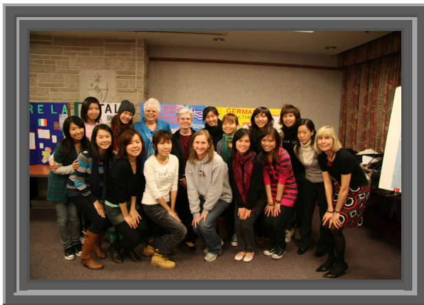
Delegation of CUHK Nursing students at Bellarmine with BU Nursing students and faculty

Deanna Gordinier Bellarmine Nursing Service Program in Romania