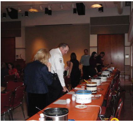
Above: Judges surveying the variety of chili entries.